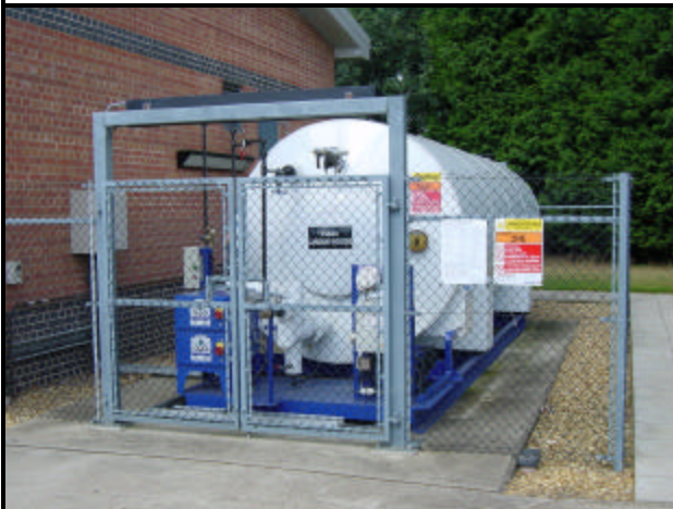
A liquid CO 2 storage tank secured with a gate.