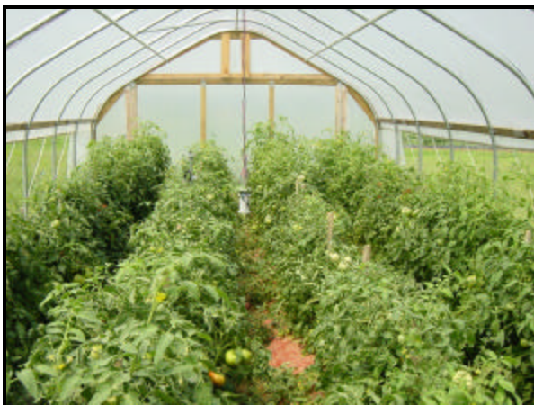
High tunnel tomato production.