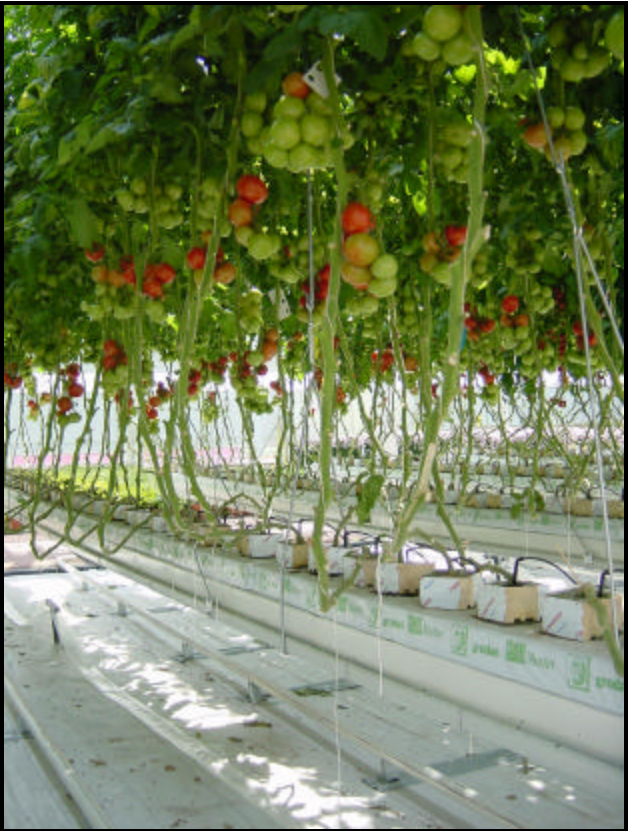
A deflated polyethylene tube (visible between the two metal heating pipes on the floor of the greenhouse) used to distribute CO 2 gas. The tomato crop is grown hydroponically in gutters that are elevated for ease of harvesting.

For some crops (e.g., leafy vegetables), research has shown that, within limits, supplemental lighting can be “traded” for CO 2 enrichment. This means that instead of adding a certain amount of supplemental lighting, the CO 2 concentration can be increased resulting in the same increase in crop growth. The obvious advantage is that adding CO 2 is likely to be cheaper than running the supplemental lighting system. A computer control system can be used to determine when it is more advantageous to add CO 2 or when it is necessary to run the supplemental lighting system (e.g., when the solar radiation causes the greenhouse to heat up above the set point temperature, necessitating the operation of the ventilation system and making CO 2 enrichment uneconomical). The benefits of CO 2 enrichment can be further exploited when the set point temperatures are allowed to drift upward at the beginning and towards the end of the light period. These higher set point temperatures would delay the onset of ventilation, making CO 2 enrichment economical during those periods of the day. However, such a strategy should always be tested first for the particular crop(s) grown. During periods of the day with a high light intensity, it is likely that the ventilation system is needed to maintain the set point temperature, and under those conditions, CO 2 enrichment is probably not economical.