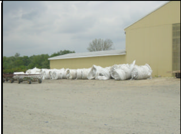
Example of plastic recycling at a nursery.