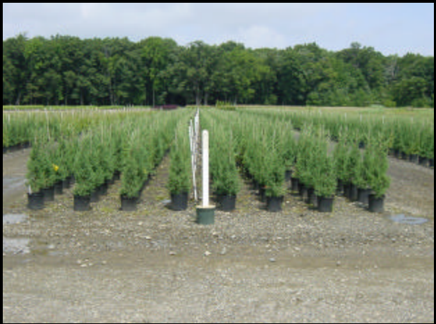
Plastic pots used for growing nursery plants.