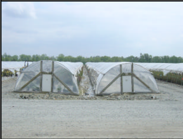
Example of the use of polyethylene film to cover overwintering hoops at a nursery.