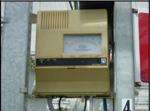
A CO 2 sensor located inside a greenhouse and used for monitoring and control of the CO 2 concentration. The readout from this sensor can be used to operate a solenoid valve either manually or with a computer control system. Opening the valve will allow pure CO 2 gas to be distributed throughout the greenhouse.