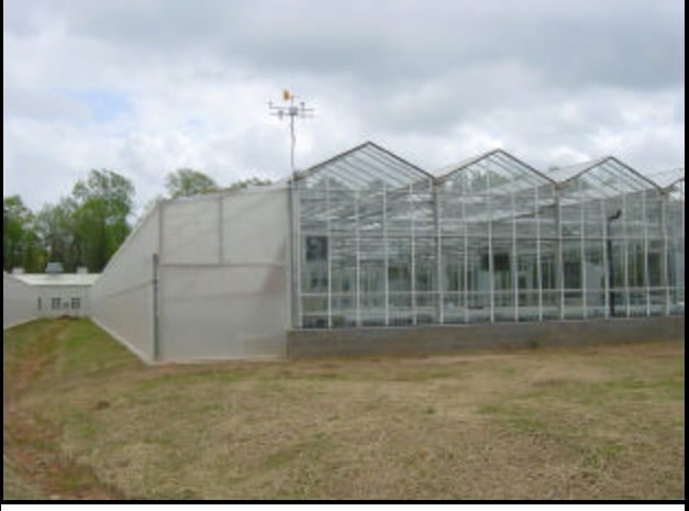
Photo 1. NCSU, the new teaching and esearch greenhouses with insect screening. sidewall with the ventilation inlet opening.

ployees can be required to change clothing Mesh size = threads per linear inch