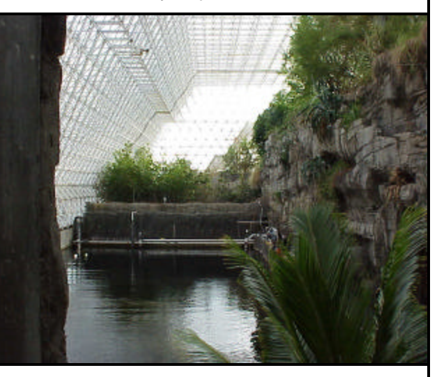
View of the section where the ocean environment is reproduced.

A worker is planting new transplants along the existing crop. The white plastic on the floor reflects light back into the crop.