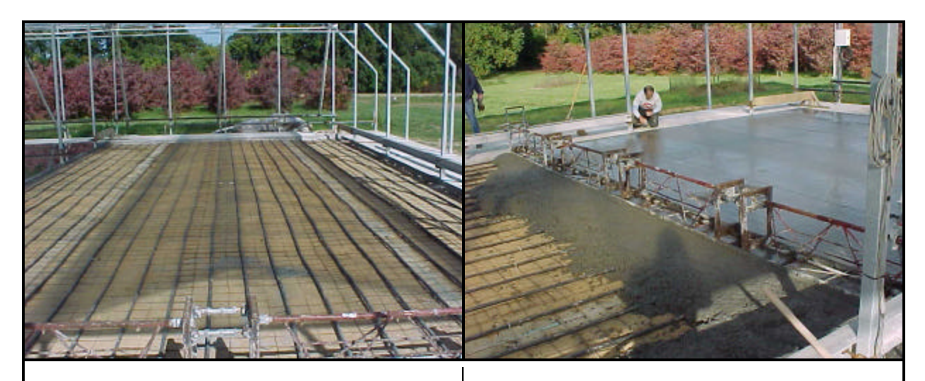
Photo 1. The (black) heating pipe is secured onto the reinforcing wire just prior to pouring the concrete. The pipes are spaced 12 inches on center.

Photo 2. The concrete floor is partially poured. The heating pipes are still visible on the left side of his picture. The floor is 4 inches thick. A special power screed finishes the floor at the correct elevation.