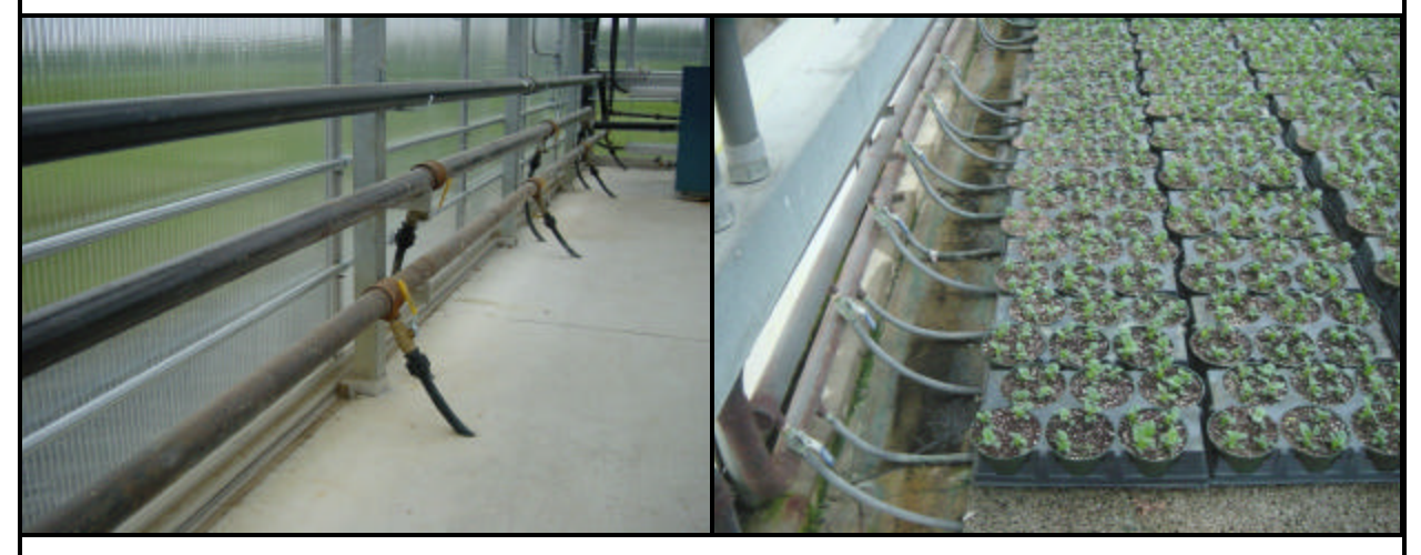
Photo 3. The plastic heating pipes are emerging from the concrete floor and are attached to the supply and return lines, which are connected to the hot-water boiler. Two valves are installed in each heating loop in case the loop needs to be isolated for maintenance or repairs.

environment. This practice allows for very uniform temperatures to be maintained in the microclimate surrounding the plants. The result is improved uniformity of plant growth and development. In addition, significant energy savings can be accomplished. Finally, the heat stored in a floor heating system can be used to heat the greenhouse during periods of power outage or boiler failure.